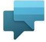
Power Virtual Agents

Microsoft Power Platform allows you to adapt to a changing business environment quickly - analyse data, build solutions, automate processes. It bridges the gap between the data you already have and the solution you need to analyse and visualise the information.